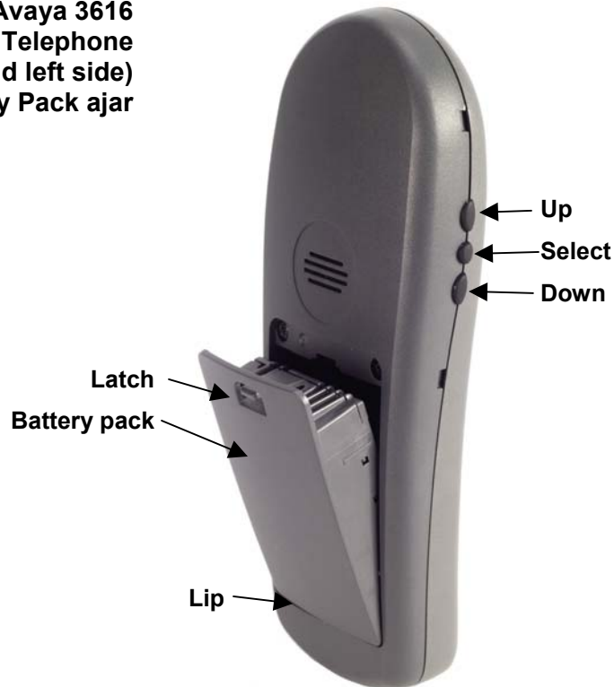
Avaya 3616 Wireless Telephone (back and left side) with Battery Pack ajar